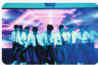
College Day Celebrations