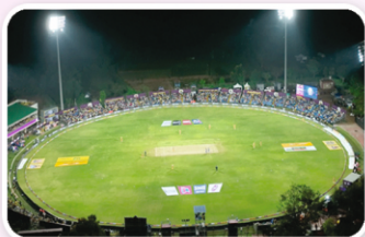
Turf Cricket Ground

Sports, Cultural Events & Infrastructure