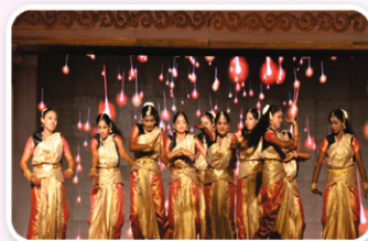
Women's Day Celebration