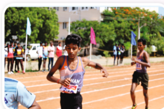
Athletics Track & Field